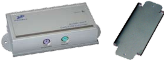
Unit attached with Rack Mounting Kit and the Rack Mounting Kit