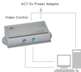
Installation of Receiver