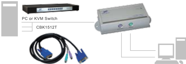
Connection of Transmitter