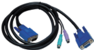
CBK1512T 3in1 KVM Cable